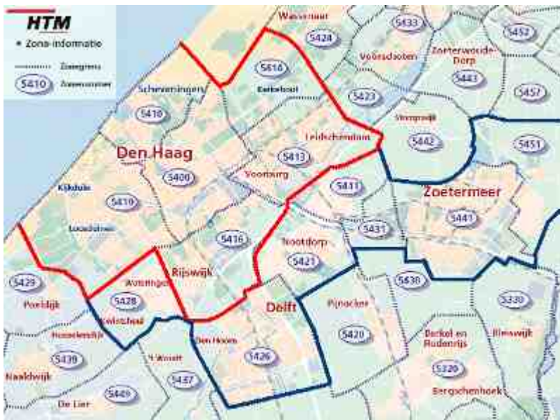
Zones for Den Haag day ticket